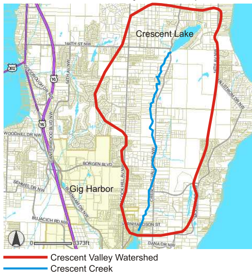
Crescent Valley Area Map